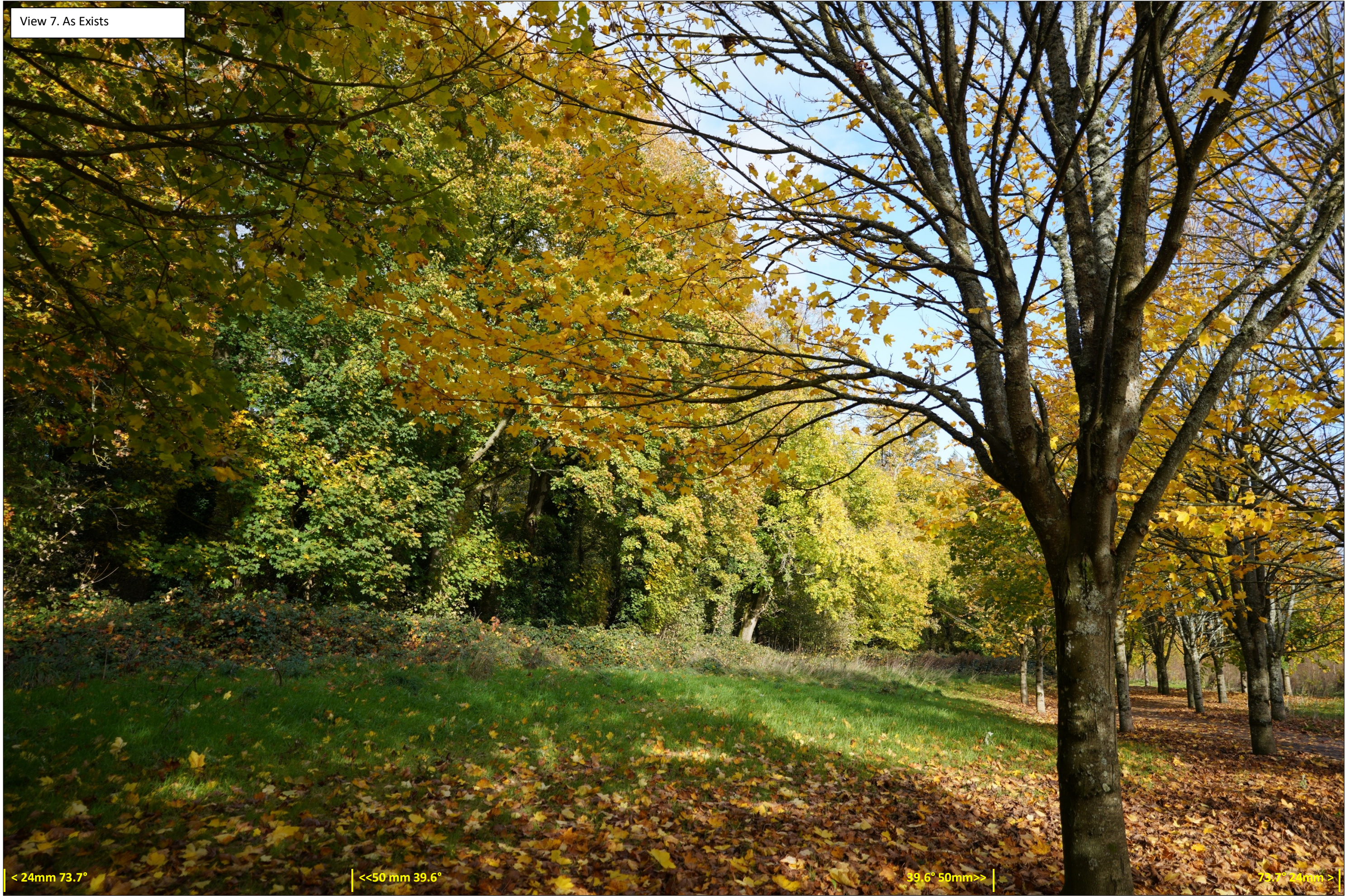
View 7. As Exists

< 24mm 73.7° | <<50 mm 39.6° | 39.6° 50mm>> | 75.7° 24mm > |