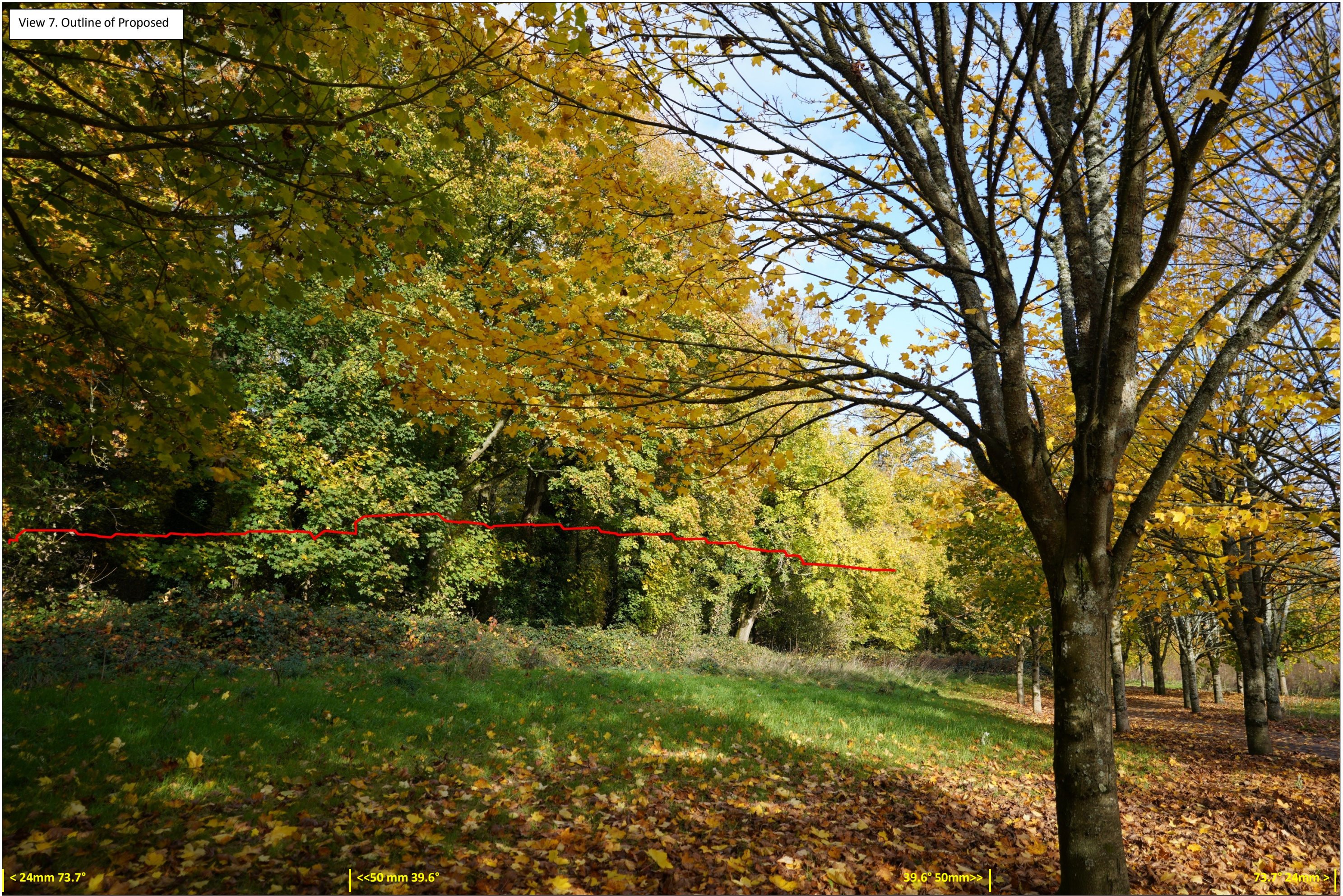
View 7. Outline of Proposed

< 24mm 73.7° <<50 mm 39.6° 39.6° 50mm>> 75.7° 24mm >