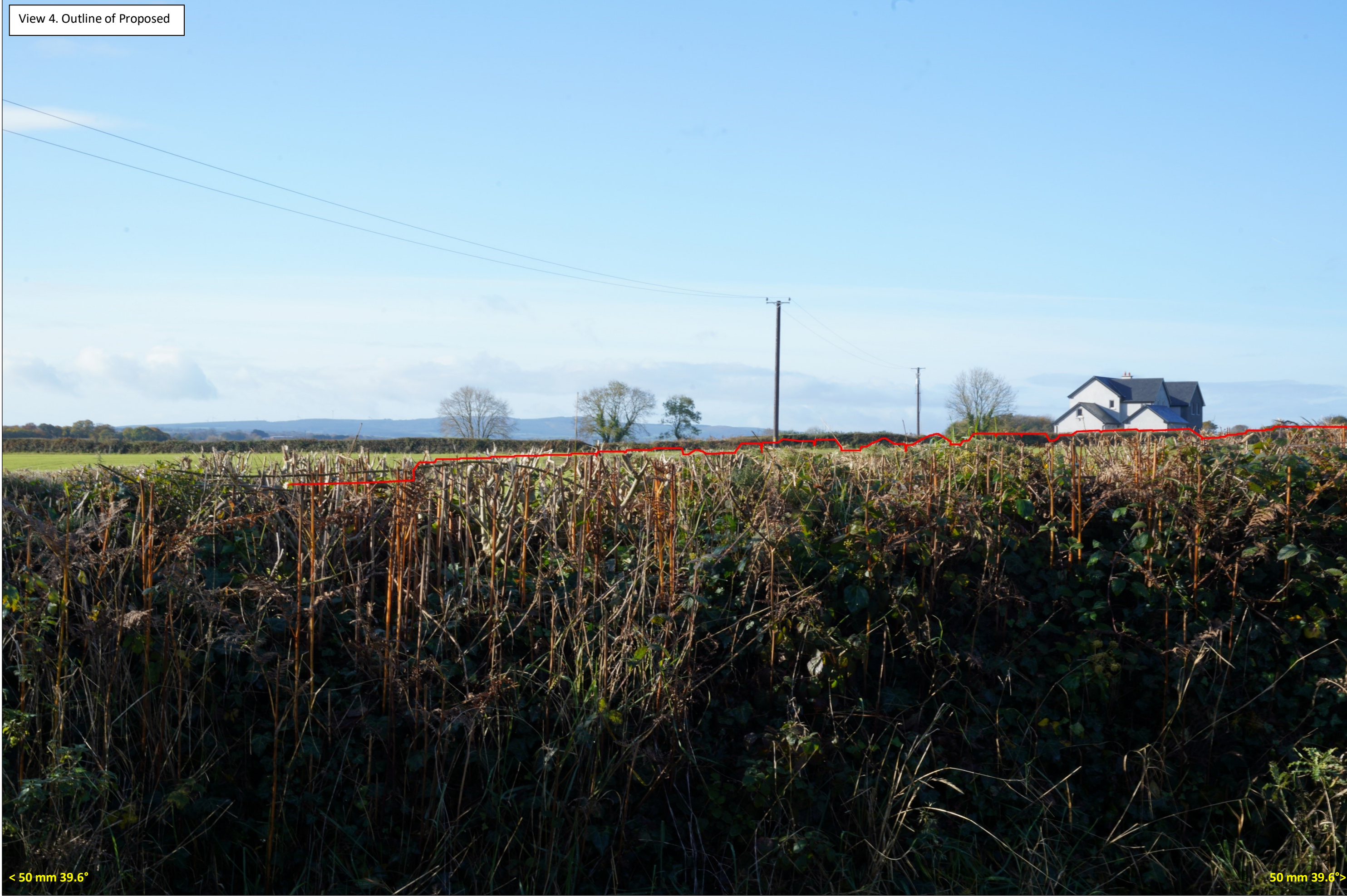
View 4. Outline of Proposed