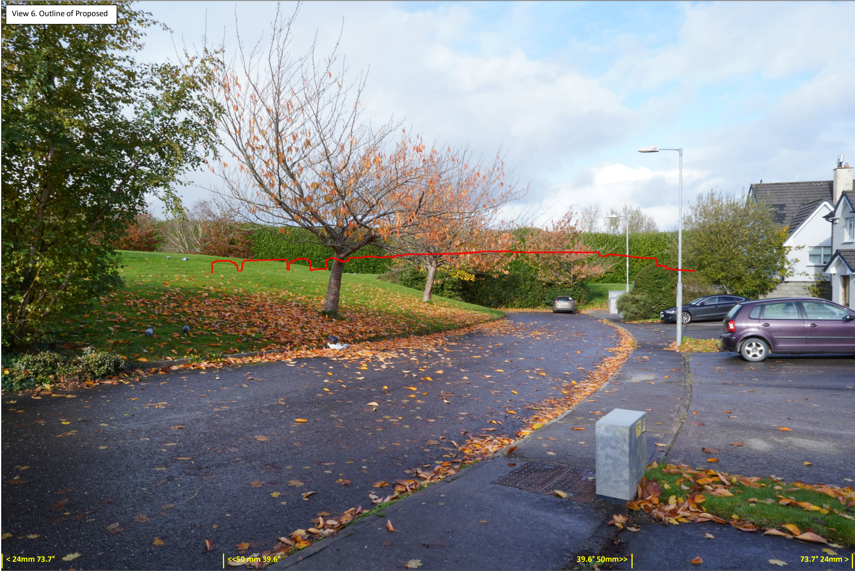
View 6. Outline of Proposed

< 24mm 73.7° <<50 mm 39.6° 39.6° 50mm>> 73.7° 24mm >