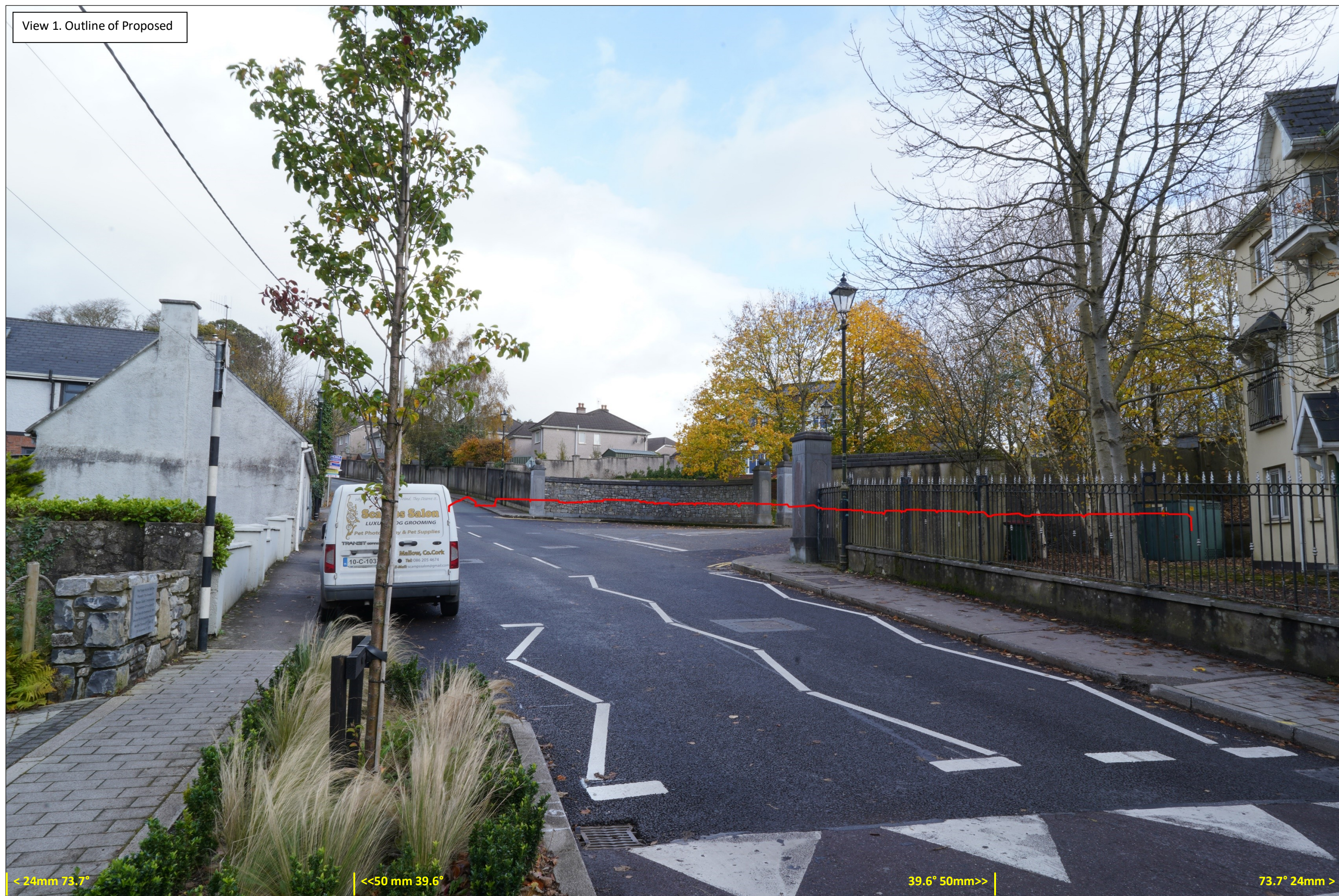
View 1. Outline of Proposed