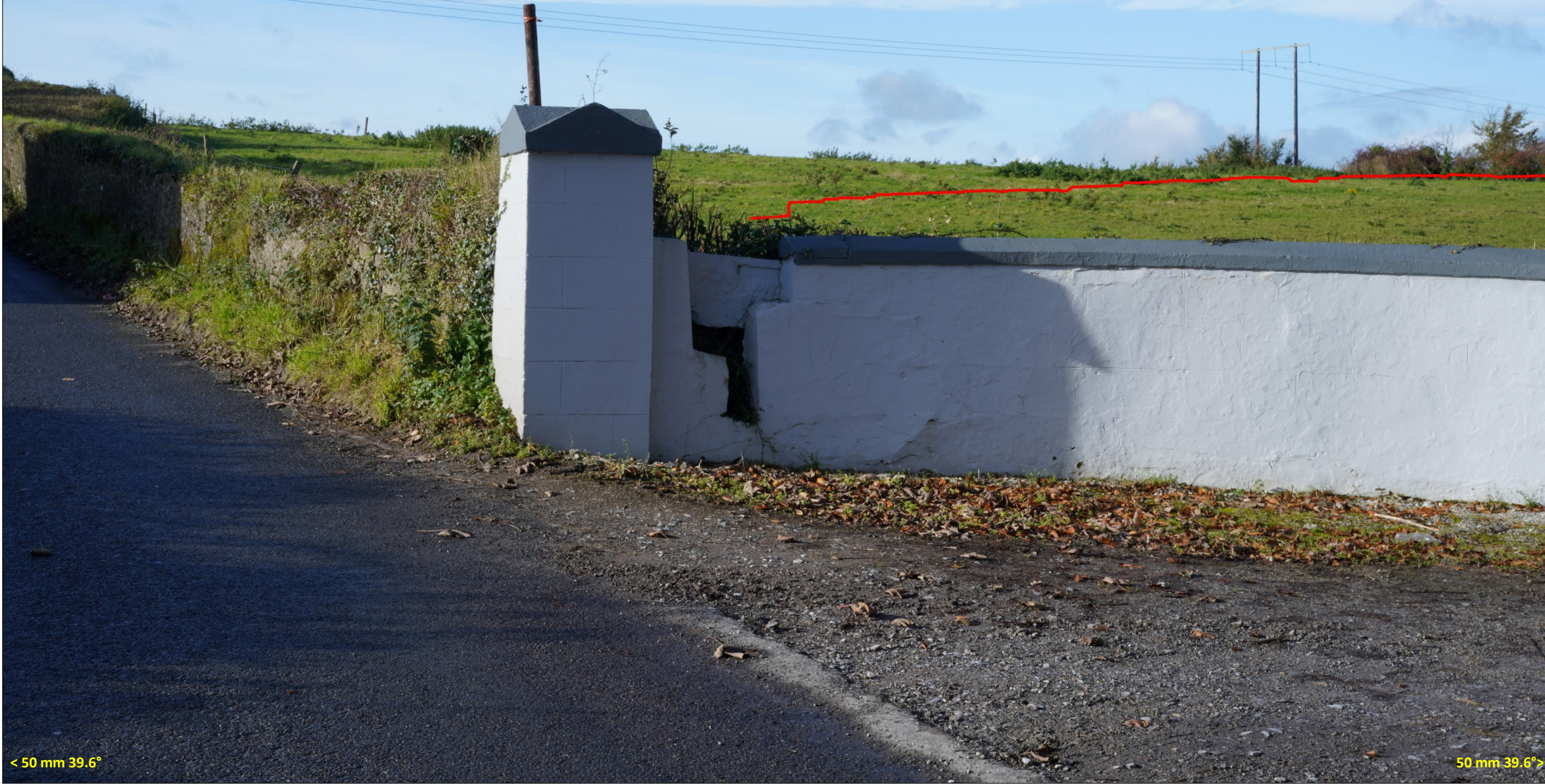
View 5. Outline of Proposed