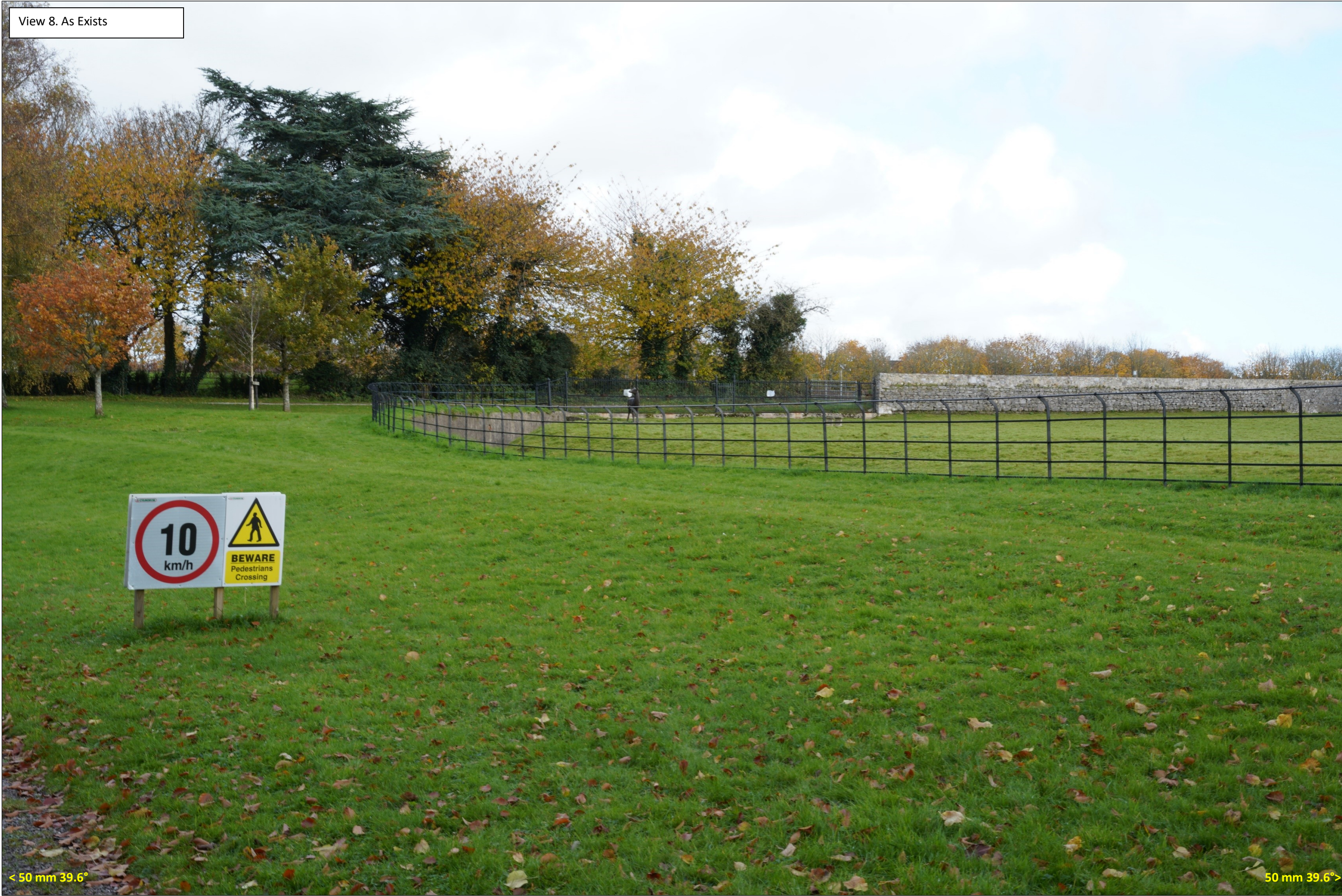
View 8. As Exists