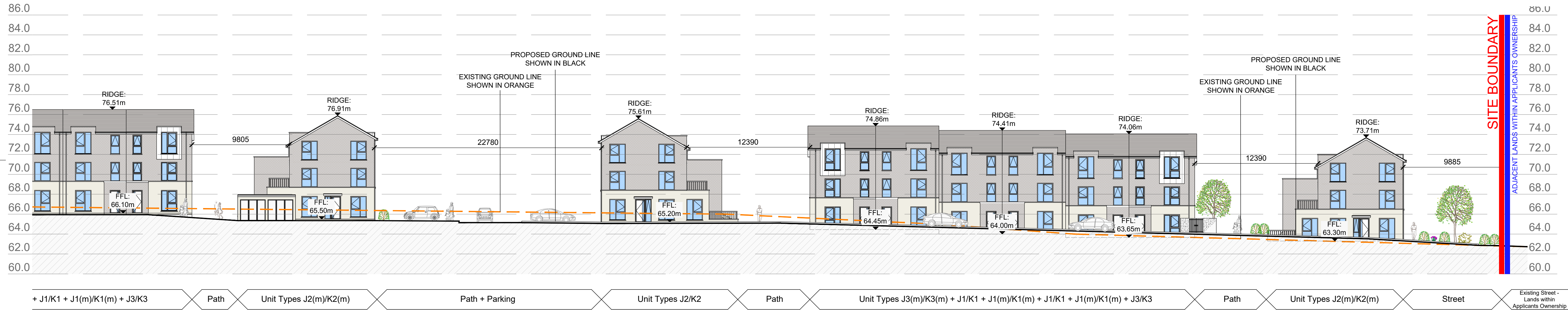
PROPOSED SITE SECTION HH (PART D) | 1:200 @ A1

SEE ENGINEERS DRAWINGS FOR ENGINEERING DETAIL SEE LANDSCAPE ARCHITECTS DRAWINGS FOR LANDSCAPING DETAIL